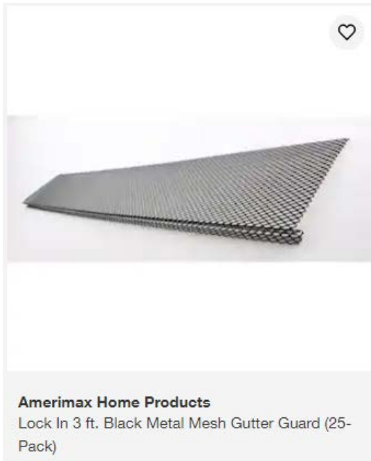
Amerimax Home Products Lock In 3 ft. Black Metal Mesh Gutter Guard (25-Pack)

Use the products displayed below or products of equal comparison.